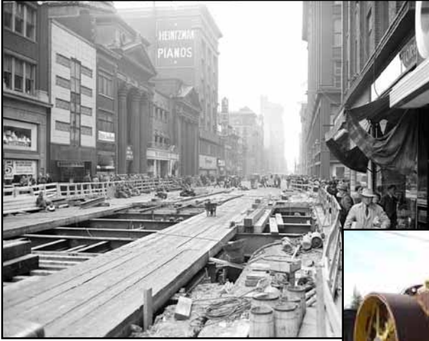
Construction Site Photos

Do you have construction items from the past 100 years?